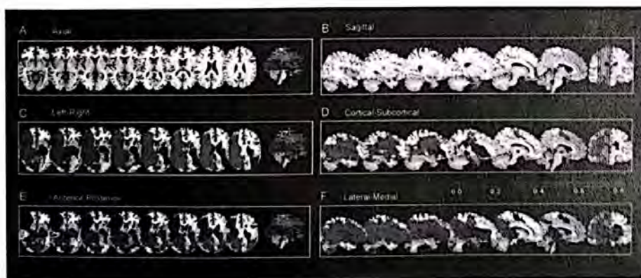
Figure 1. Lesion overlay maps of stroke patients, subdivided in the four binary partitions considered in the text. In each partition, colors associated to damaged points indicate the fraction of patients of the first considered subgroup having the relevant point damaged out of the overall number of patients having that point damaged. Lighter colors indicate that among the patients having that point damaged, the first subgroup dominates: The reverse is true for the darker colors. (A) and (B) show, respectively, axial and sagittal selected slices of the reference brain (ch2bet.nii.gz). (C) Left–right group; (D) cortical–subcortical group; (E) anterior–posterior group; (F) lateral–medial group. All axial and sagittal slices correspond, respectively, to -7, -2, 3, 8, 13, 18, 23, 28 and 39, 32, 25, 18, 11, 4 mm in the Montreal Neurological Institute (MNI) space.

In order to replicate our previous results (Farinelli et al., 2013) and extend them to a larger sample (86 vs. 62 stroke patients and 115 vs. 76 orthopedic), we first focused specifically on the ANPS-SEEKING dimension. Comparison between the two groups (stroke, control) confirm previous results (Farinelli et al., 2013) in that ANPS-SEEKING scores were significantly lower in all stroke patients (regardless of lesion location) than in the control group (Table 2). The average ANPS-SEEKING scores were 33.66 and 34.87 for stroke and control groups, respectively,